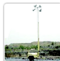
Blue Metal Quarry